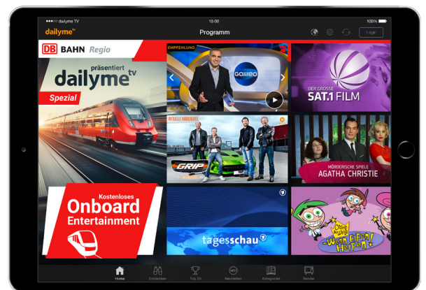
Sample equipment of HOTSPLOTS TV to go options by the customer Westfrankenbahn, Pictures: Screenshot of dailyme TV

Today, it is important for passengers to have WiFi service on board. Especially on routes with poor mobile reception, the additional on-board entertainment makes it possible to improve passenger satisfaction. With HOTSPLOTS TV to go, the on-board offer is updated daily, so that an attractive portfolio is always available for commuters or for multi-day trips. As a result, for passengers, longer trips speed past.