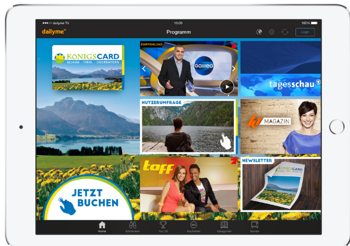
Sample equipment of HOTSLOTS TV to go offered at the customer, Königscard, Pictures: Screenshot of dailyme TV

Digital content is automatically updated every day as new data becomes available. The content offerings can be customized as needed and the interface of the app can be presented in your own design on the customers' devices. This way you offer your guests the best entertainment with recognition value!